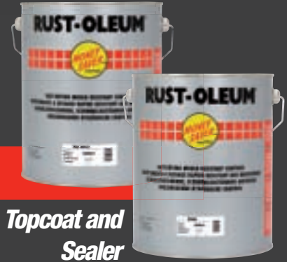
Topcoat and Sealer