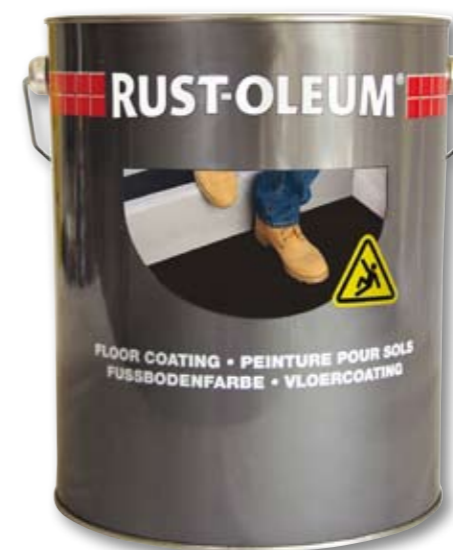
0.75l - 5l See colours for item numbers