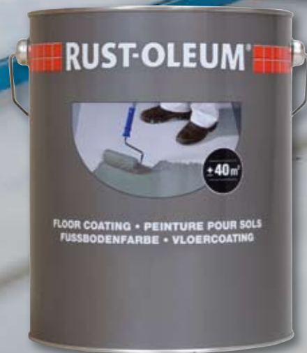
0.75l - 2.5l - 5l - 20l See colours for item numbers