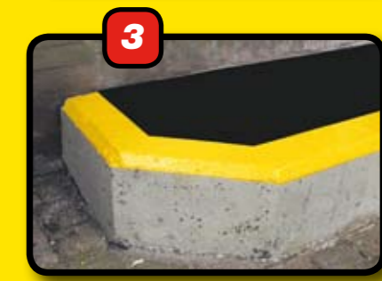
Slip resistant aggregate is pre-mixed in the coating