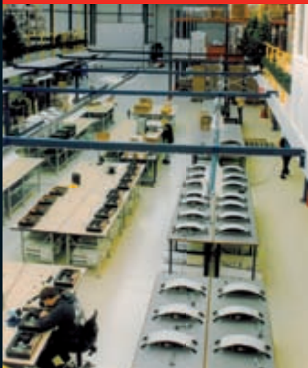
5500 coating applied on electrical component factory floor in The Netherlands