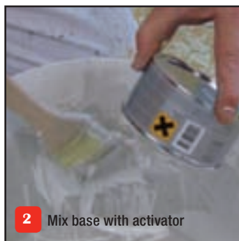
2 Mix base with activator