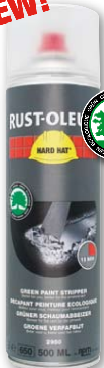
2950 - 500ml