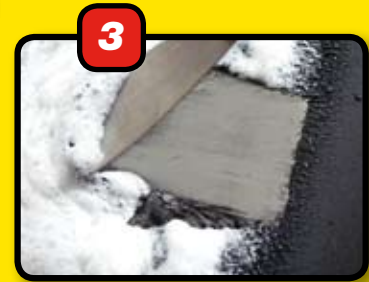
Remove paint layer