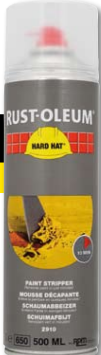
2910 - 500ml

Removes all alkyd and emulsion paints, varnishes, most 2-component coatings (epoxies and polyurethanes). Ideal for difficult to reach places, vertical surfaces included!