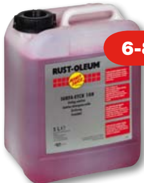
108.5 5 litres