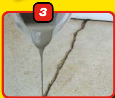
3 Pour mixture in the crack and level off with scraper