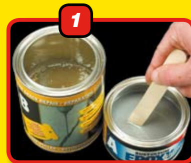
1 Stir the contents of component A