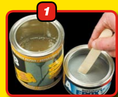
1 Stir the contents of component A