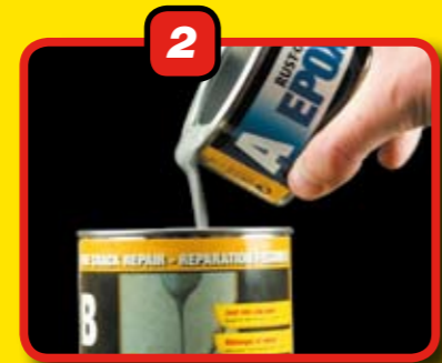
2 Mix component A and B and stir