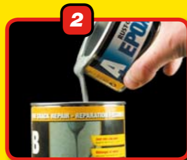
2 Mix component A and B and stir