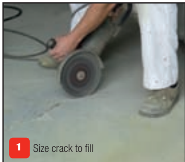
1 Size crack to fill